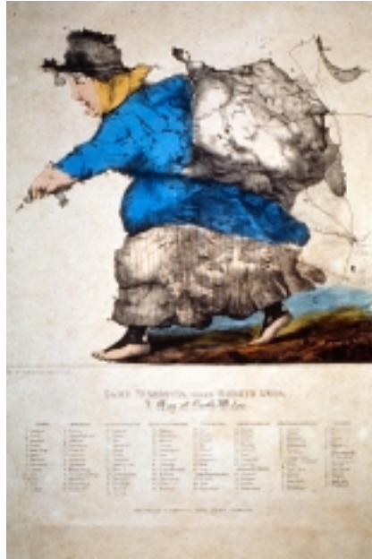
[Illustration 4: Dame Venodotia alias Modryb Gwen , cartoon by Hugh Hughes, c. 1845-50. Museum of Welsh Life accession no. 49.499.]

It is during these years of the first third of the 19 th century that Lady Llanover and a number of other interested parties began to take a hand. Lady Llanover's motives, though stated in her essay, 'On the advantages resulting from the preservation of the costumes of the Principality', are not entirely transparent. She rails against 'false respectability which encourages forms of dress incompatible with "active employments"' and 'exchanging wool packs for bales of cotton', with the resultant demands for higher wages, as well as the loss to artists of the picturesque. What she does not state, interestingly enough, is that people should wear these costumes in order to express their nationality, more rather to support the manufactures of their country. Nowhere does she advocate one particular type of 'costume' and in fact the watercolour sketches which she produced to accompany her essay are all quite different and although not necessarily in reality restricted to the counties to which she assigns them, they all contain elements of traditional dress recognisable from the earlier illustrations and descriptions mentioned above. More interesting, perhaps, is the fact that they also contain elements of fashionable dress of the period, such as high waistlines, puffed sleeves and caps with lappets.