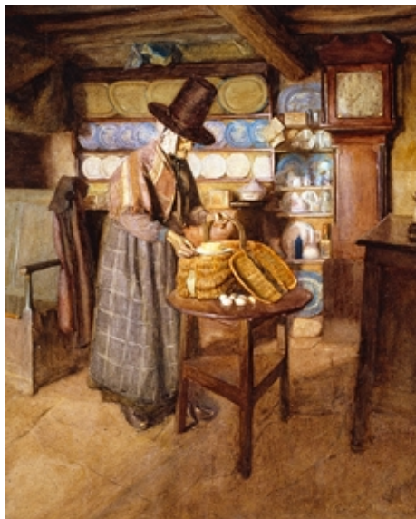
[illustration 1: Market Day in Old Wales , watercolour by Curnow Vosper, c. 1910. National Museum and Gallery Cardiff, Art no. NMWA 2137. Original in artist's copyright]

In order to attempt to judge the influence of Lady Llanover in the matter of national costume, and indeed, Welsh textiles, it is necessary to look at the situation prior to 1830 and to look at other influences which affected the situation in Wales in the mid 19 th century and then assess its development in the later 19 th century. Undoubtedly by the date at which Curnow Vosper painted A Market Day in Old Wales a very definite idea existed of what Welsh national dress should be - what we have here is an intentional image created by an artist - a demonstration of Welshness, not necessarily typical of rural dress in general within Wales, certainly not by the early 20 th century when this picture was painted.