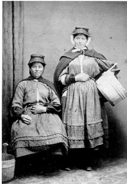
[illustration 7: Carte de visite of Swansea cocklewomen, taken by T. Gulliver of Union Street, Swansea, circa 1860. Museum of Welsh Life accession no. 42.126]

image (and many of whom kept a 'dressing up box' for this purpose), but there were others working in Wales, who were more interested in preserving a vanishing way of life, or recording a particular craft or occupation, and these can be extremely useful to the historian.