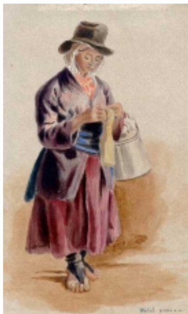
[illustration 3: Welch woman , watercolour sketch, artist unknown, early 19th century; showing footless stockings. Museum of Welsh Life accession no. F84.159.48].