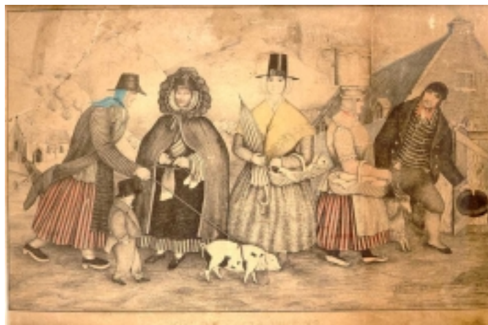
[illustration 6: A Market Day in Wales, 1851, Museum of Welsh Life accession number 52.26.1]

The very earliest prints seem to have been based upon real images, gathered together by the artist from a number of different sources, and put together to form a representation of a variety of Welsh dress. One widely reproduced and copied print was taken from a drawing by J. C. Rowland in 1848, the costume is not so exaggerated as to be unbelievable and includes a reasonable variation in styles. Another group from Llanberis from the same period shows that, although the tall hat is beginning to appear, the old form of the man's felt hat still exists. Another rather primitive print by R. Griffiths dated 1851 also shows different styles of bedgown, including the loose gown which did not gain universal popularity and would now not be recognised as part of a Welsh costume. It is probably not a coincidence that this is a rather bulky and unattractive garment.